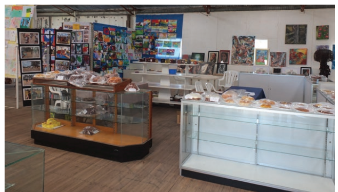
Photo: Refurbished Willacy Pavilion floor

Being part of the Show's set-up and celebration was a memorable experience – Wandoan continues to inspire us and make us feel proud to be a part of supporting the region.